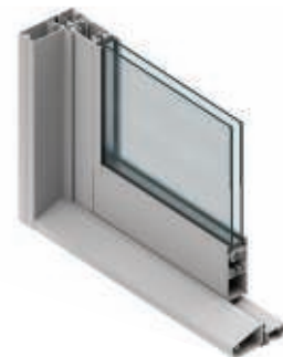
Series 900 Hinged Door Narrow Stile Non-Thermally Broken HLSI