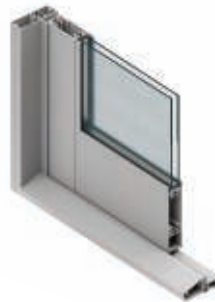
Series 900 Hinged Door Medium Stile Thermally Broken HLSI

Actual values may vary depending on product specifications and configuration. *Glass Makeup = 1" OA E366/Argon/Clear